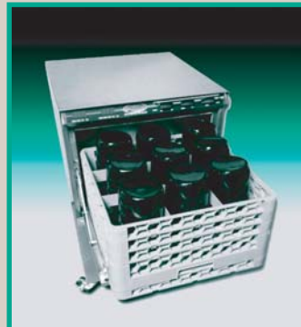
SWASH™ Convertible Bottle/Stemware Washer