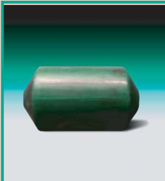
SWASH™ FDA Silicone Pig