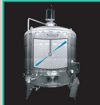
MOOG ER-55 Tank Washer