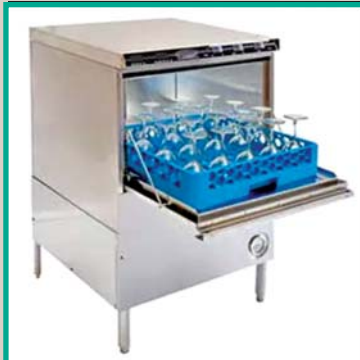
SWASH™ Stemware Washer