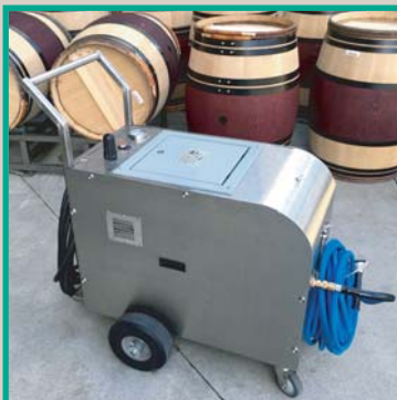
SWASH™ 16901 Pressure Washer