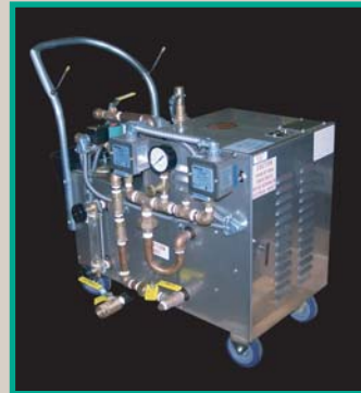
SWASH™ Standard Portable Electric Steam Generator