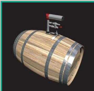
MOOG BRA Barrel Washer