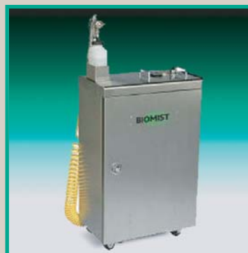
Biomist Power Sanitizing System