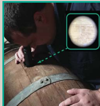
SWASH™ 62000 BarrelScope™ Inspection Device