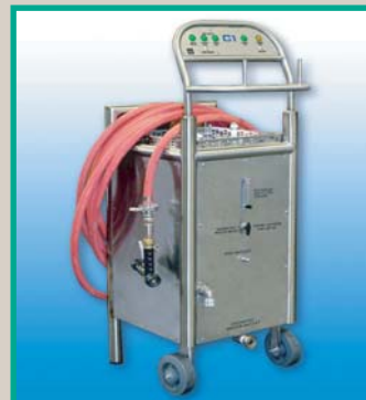
ClearWater Tech C1 Mobile Cart