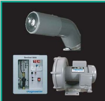
Fogmaster Sentinel 5850-H